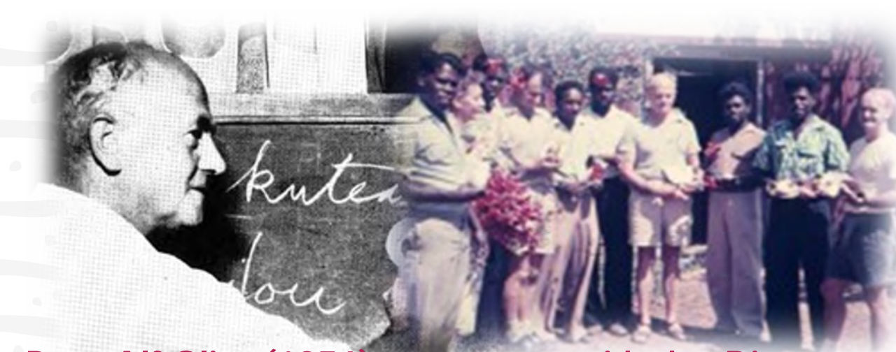
..with the Directors Lockhart River Christian Cooperative c. 1959